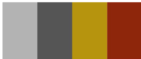
grey dark grey yellow red