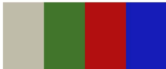
sahara green ferrari blue

Product colours will differ slightly and it is best to obtain actual colour samples where required.